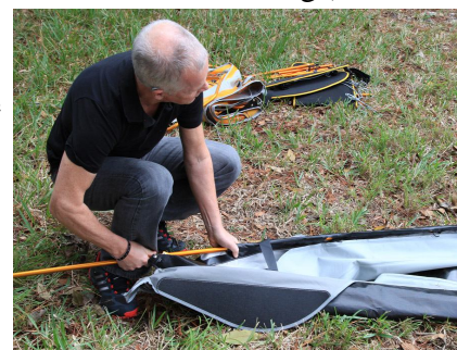
Inserting the Gunwale Rod