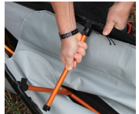
Short Straight Rods