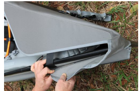
Stern End Cap Flap

that wraps around the stem and secures to the skin's Velcro strip. The handle is attached on one side, and you need to pull it across the hull over the end cap and attach the other end of the handle strap the same way, noting that the handle is completely symmetrical. Please refer to the picture if somebody undid both ends.