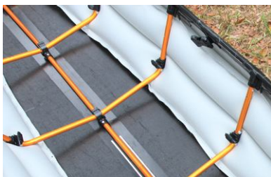
Air Tube Position