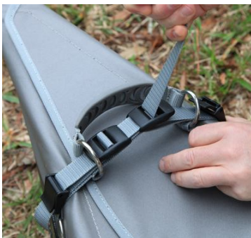
Strap and Handle

Your Puffin is now complete. We hope you will have a great time on the water.